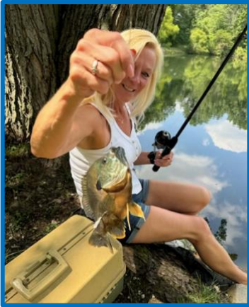
Got A Fish!